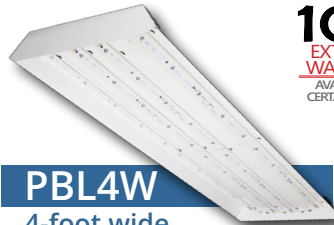
PBL4W 4-foot wide

Lumen output packages: Super Low, Very Low, Low, Medium, High *Output range: ~12,000-25,000 lumens Replaces: 400W metal halide 400W pulse start metal halide 4-lamp T5HO 5-lamp T5HO 6-lamp T5HO 6-lamp T8 with high ballast factor 7-lamp T8 with high ballast factor 8-lamp T8 with high ballast factor 9-lamp T8 with high ballast factor