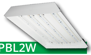
PBL2W 2-foot wide

Lumen output packages: Low, Medium *Output range: ~8,800-12,000 lumens Replaces: 150W metal halide 250W metal halide 2-lamp T5HO 3-lamp T8 with high ballast factor 4-lamp T8 with high ballast factor