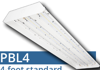
PBL4 4-foot standard

10 YEAR EXTENDED WARRANTY AVAILABLE ON CERTAIN MODELS