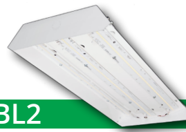
PBL2 2-foot standard

Lumen output packages: Low, Medium, High, Very High, Super High *Output range: ~28,000-68,200 lumens Replaces: 750W pulse start metal halide 1000W metal halide 7-lamp T5HO 8-lamp T5HO 9-lamp T5HO 10-lamp T8 with high ballast factor 12-lamp T8 with high ballast factor 1000W pulse start metal halide