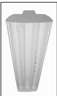
STEP 2 REMOVE LAMPS (RECYCLE LAMPS)

INSTALL GROUND LEAD TO LUMINAIRE USING TEK SCREW AND WASHER