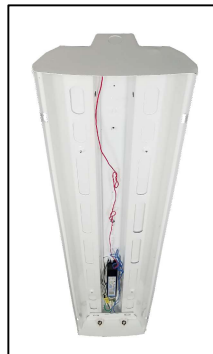
STEP 3 REMOVE BALLAST COVER