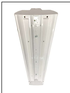
STEP 4 REMOVE BALLAST SOCKET BARS AND ANY WIRING FROM THE LUMINAIRE FOR UP LIGHT LUMINAIRE INSTALL UP LIGHT COVERS (2) 1 FOR EACH SIDE WITH (2) TEK SCREWS PER COVER