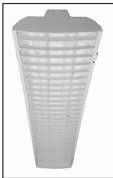
STEP 1 TURN OFF POWER REMOVE DOOR FROM LUMINAIRE