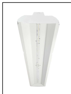
STEP 6 SWING FFRP14WRAPT8 AND SECURE TO THE FIXTURE FITTING THE FFRP14WRAP AROUND THE FIXTURE

WIRE SCHEMATIC Line side input to driver 120V to 277V and all voltages in between 120V - 277V input