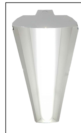
STEP 7 INSTALL LENS, INSTALL SAFETY KEYS IN THE (4) SLOTS ON THE BACK OF THE FFRP14WRAP. TURN POWER BACK ON TO THE LUMINAIRE