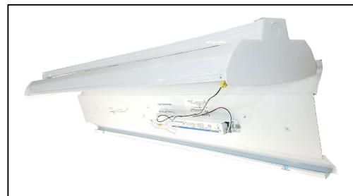
STEP 5 HANG THE FFRP14WRAPT8 USING THE SLOTS THAT WERE USED FOR THE DOOR HINGS OR LATCHES

CONNECT POWER TO THE DRIVER USING QUICK DISCONNECT PROVIDED IN THE KIT. INSTALL SAFETY TETHER AT EACH END OF THE LUMINAIRE. USING TEK SCREWS SUPPLIED IN THE KIT.