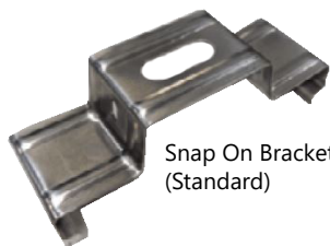
Snap On Bracket (Standard)