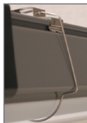
SB Safety Bail Option