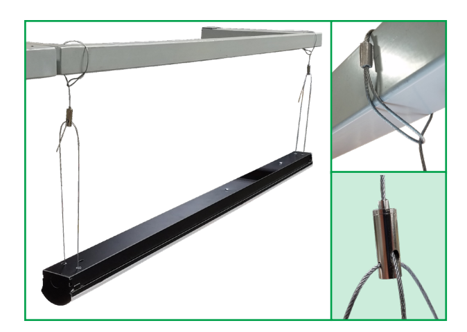
Hanging The QC hanging kit from ALP comes in 10' or 20'. Cables are pre-looped for easy installation and designed for easy fixture height adjustment. When ordered, QCs come boxed with each fixture.